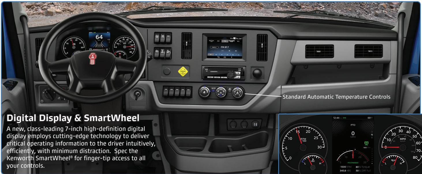
Standard Automatic Temperature Controls

For more intuitive vehicle control and superior performance from drivers of all experience levels, spec PACCAR's TX-8 automatic 8-speed transmission. With a best-in-class power-to-weight ratio, it also upshifts your payload and profit potential.