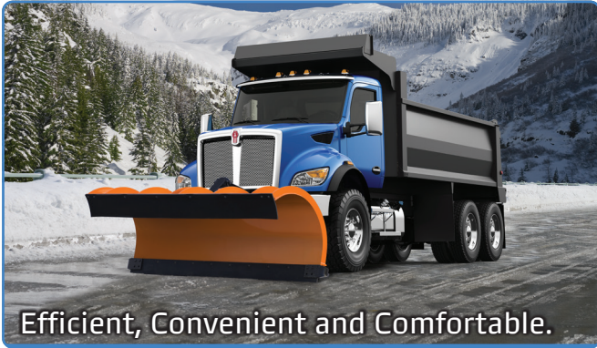
Efficient, Convenient and Comfortable.

Tough, versatile, efficient and reliable, the new Kenworth T380V/T480V vocational hood models are the ideal solution for applications requiring full parent rails and FEPTO/REPTO, as well as 4x4 or 6x6 capability.