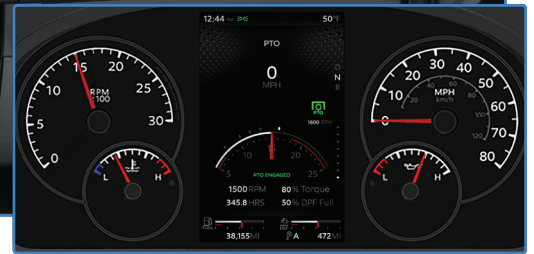
Standard Instrument Panel with 7-Inch Digital Display

A new, class-leading 7-inch high-definition digital display employs cutting-edge technology to deliver critical operating information to the driver intuitively, efficiently, with minimum distraction. Spec the Kenworth SmartWheel® for finger-tip access to all your controls.